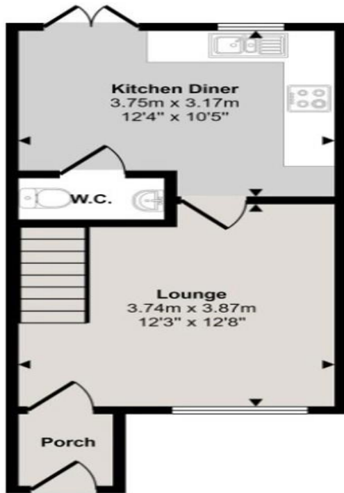
Ground Floor Approx 29 sq m / 309 sq ft

Approx Gross Internal Area 56 sq m / 605 sq ft