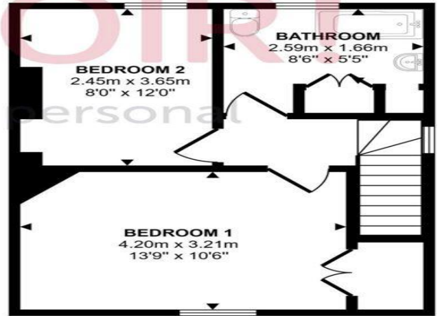
First Floor Approx 36 sq m / 389 sq ft

This floorplan is only for illustrative purposes and is not to scale. Measurements of rooms, doors, windows, and any items are approximate and no responsibility is taken for any error, omission or mis-statement. Icons of items such as bathroom suites are representations only and may not look like the real items. Made with Made Snappy 360.